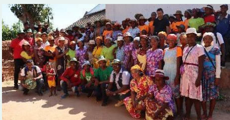
Joint field visits Fifata-Fert, Madagascar, 2023