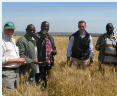
Initial diagnosis mission, CGA-Fert, 2014.