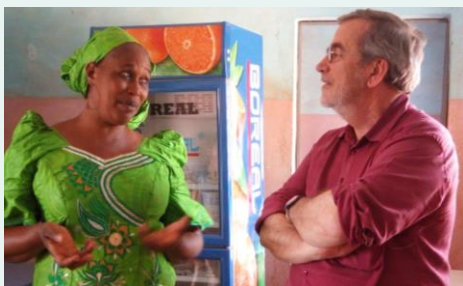
Field assessment, cowpea FO chairlady and Fert chairman, 2018.