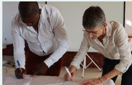
The signing of the Fert-Fifata partnership agreement, Madagascar, 2023.